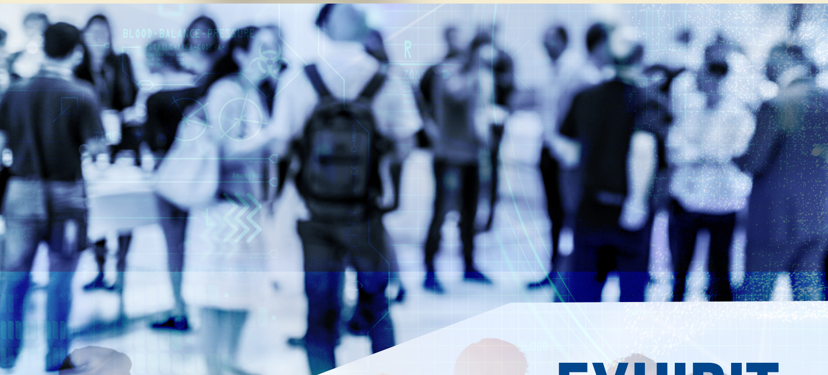
EXHIBIT SPACE INFORMATION