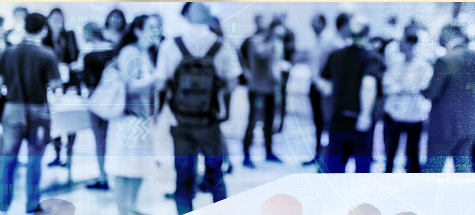
EXHIBIT PERSONNEL REGISTRATION INFORMATION